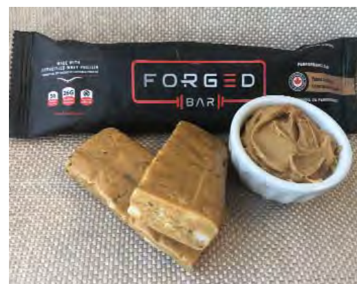
Images - Top to Bottom: MN Fare's salsa; plant protein bar from Brain Bar Nutrition Inc.; "Chicken" fingers from plant-based proteins; Forged Bar, performance bar made with peanuts for bodybuilding enthusiasts